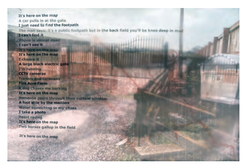
It's here on the map, part of the series Find.ers.Keep.ers, 2021. Layered transparent prints, framed with double glass. See more about this project at SLQS' blog, https://slqsstudio.com/blog/finderskeepers/hereonthemap

considerable period of time, conflated the status of animals with Black people and people of colour within Common Law.