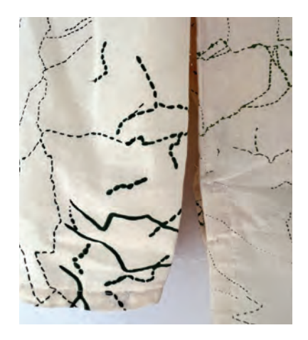
Áo dài (detail left) handsewn and screenprinted by the artist with UK rights of way, including bridleways, 2023.