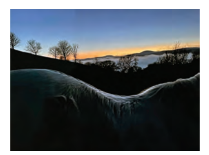
Blue , from the series Áo dài , 2022, photograph by SLQS. Digital print, 30 x 25 cm framed.