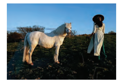
Vietnamese Mask , from the series Áo dài , 2022, photograph by Annette Lister. Digital print, 30 x 25 cm framed.