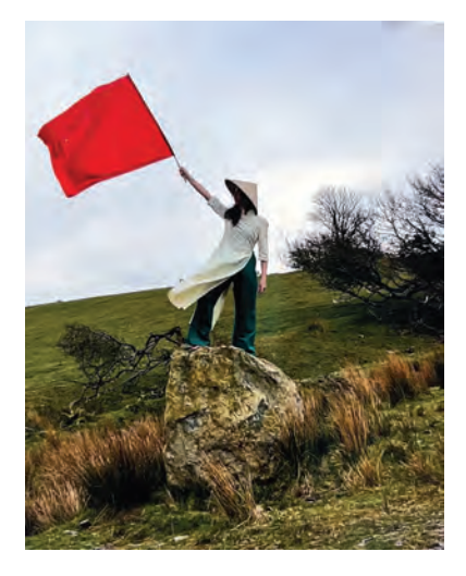
Rural Diversity Revolution , from the series Áo dài , 2022, photograph by SLQS, digital print.